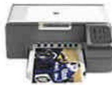
▶ Epson Inks