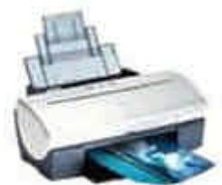
▶ HP Inks