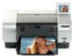
▶ Canon Inks

We provide competitively priced compatible inkjet cartridges for inkjet printers.