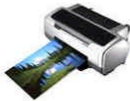
▶ Brother Inks