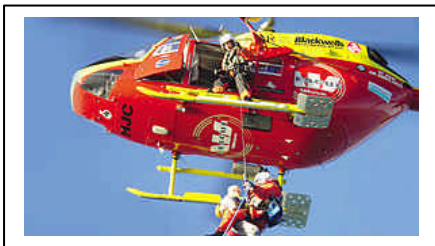
Westpac Rescue Helicopter